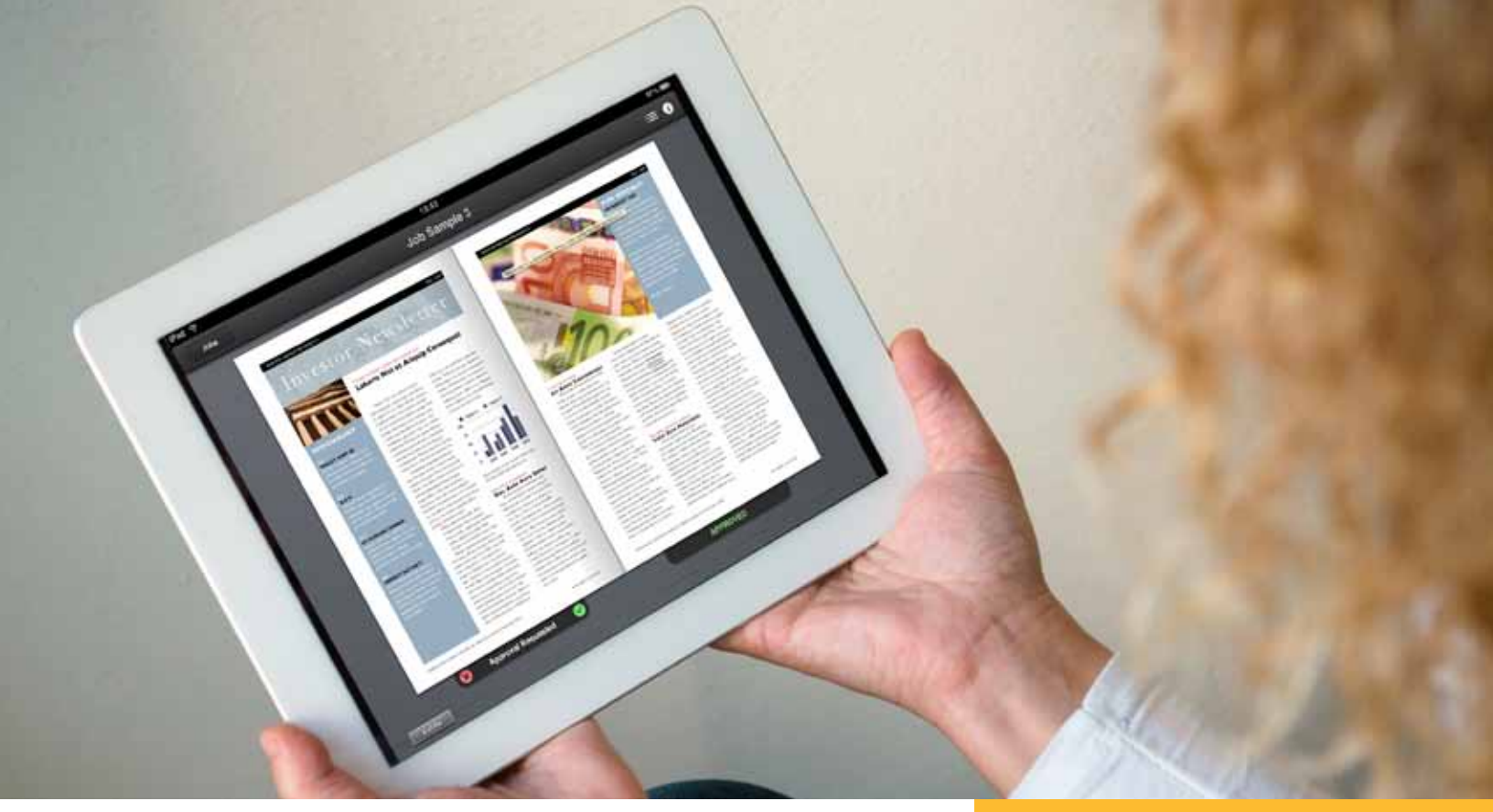
Review, approve and annotate from your Apple iPad tablet.